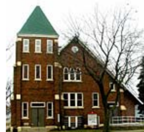
North Church has been located in Kalamazoo County since 1919.

Located in the urban center since 1919 (in the same area