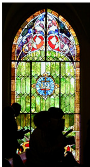
A stained glass window with people in silhouette. North Church is a place of welcoming and nurturing that is lifted by compassion.

since its founding in 1864 by four young women!) the church has been an "incubator" of kingdom seeds — addressing racial injustice, hunger and housing. Since 1989 it has been a place of welcome and inclusion for people living with disabilities — particularly serious mental illness and brain injury. Partners in ministry include the Presbytery of Lake Michigan, other congregations, and community mental health individuals.