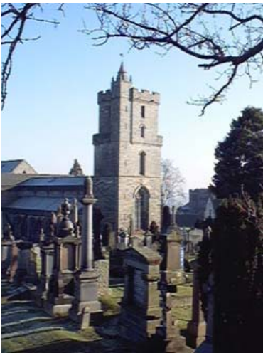
The Church of The Holy Rude

The church was first built in 1129 A.D. but was destroyed by fire in 1406. It was rebuilt and basically completed in 1414 with some additions to the Choir (eastern) part in 1507 and 1546. Still considerably older than the Presbytery of San Fernando.