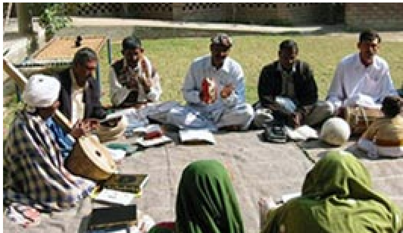
A group of Pakistani Christians meeting for prayer and study.

Right now, there is relative calm. Pray for the sake of the nation that it stays that way. Pray for the peace of the church, which is primarily comprised of some of the poorest people in the nation. And, especially pray for the tremendous troubles right now in Kenya, and God's work there. But the real message here is: Pray. Pour your heart out to God for the church and world. Your sisters and brothers in mission depend on you. God bless you all.